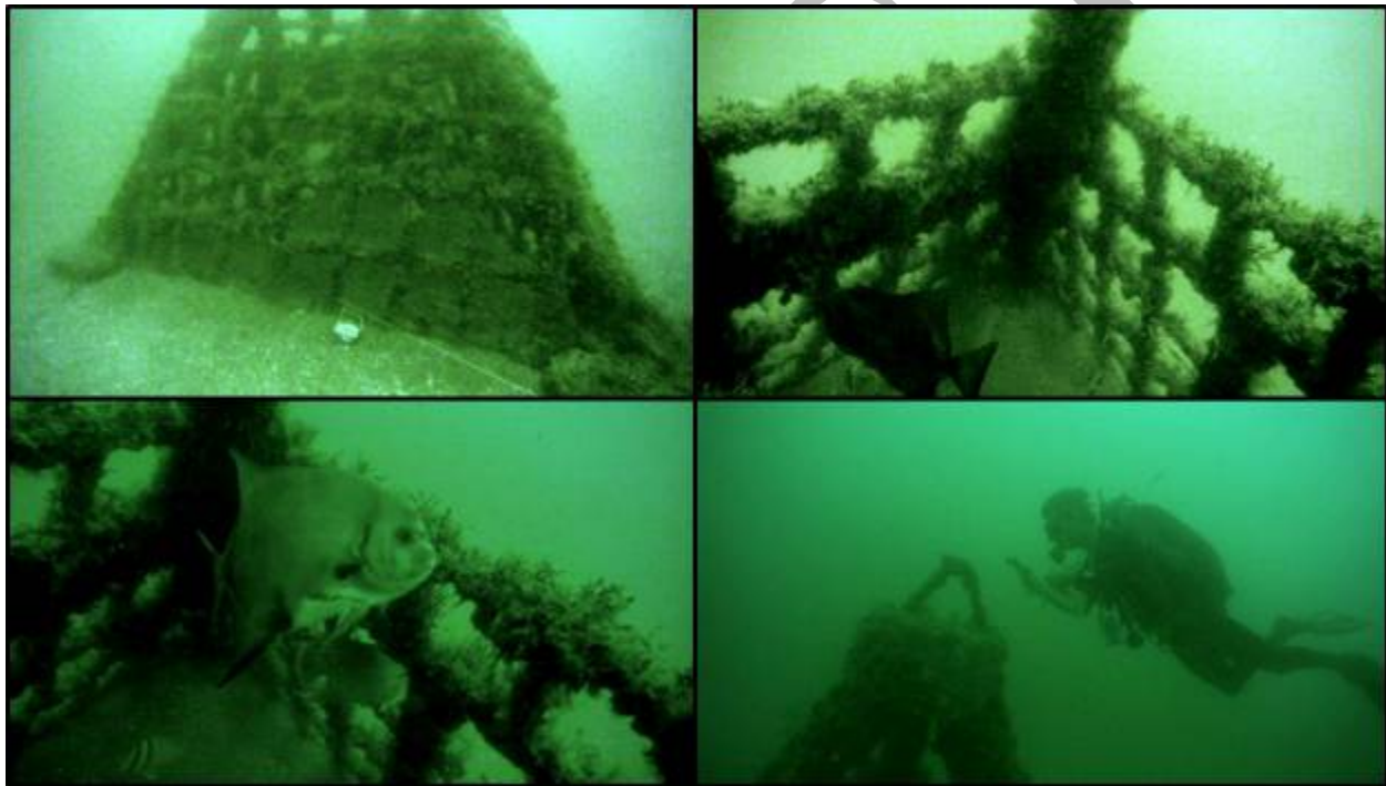
Figure 7. Cement Barge – 4 Reefmakers 2012 photographs.

Because of shifting sediments in this area, some sides of the concrete bases were almost buried. In our opinion, this is a seasonal occurrence, and is not cause for concern when evaluating the overall effectiveness of the Reefmaker units. The photographs in Figure 7 show the general condition of the Reefmaker units surrounding the Cement Barge site.